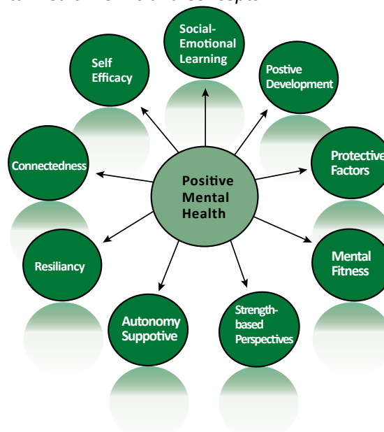
Figure 2: Positive Mental Health Terms and Concepts

Participants were asked to define the term positive mental health in relation to the educational or school setting, and to identify terms or words used to describe aspects of positive mental health within the school or school health context. Reported key positive concepts or aspects of positive mental health included psychological wellness or well-being; positive social and emotional development; client-centered strength; state of inward readiness for learning and growth; enhanced self-efficacy; and heightened awareness of personal strengths and capacities. In addition, participants spoke of the presence of internal and external protective factors, personal resiliency, and self-determination or self-actualization. Areas of research that were seen as either synonymous to or closely related to positive mental health are presented in Figure 2.