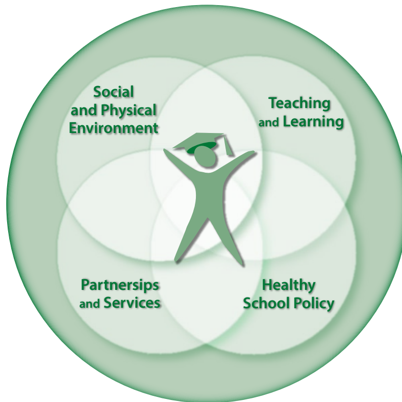
Figure 1: Comprehensive School Health Framework – Pan-Canadian Joint Consortium for School Health